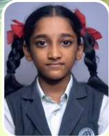
ALAINA S VI C

The wind is talking to the trees, It whispers secrets in the breeze The river sings a splashy song, It likes to dance and move along