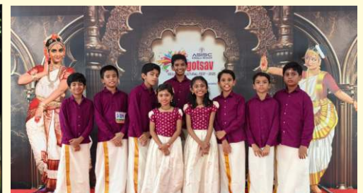
Category 3 Group Song A Grade State Zonal