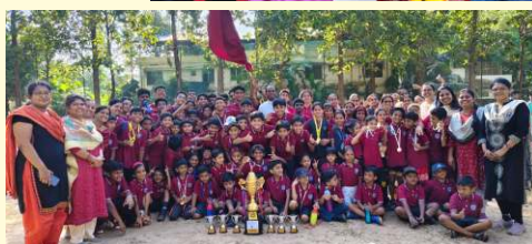
Overall champions - Arrupe House