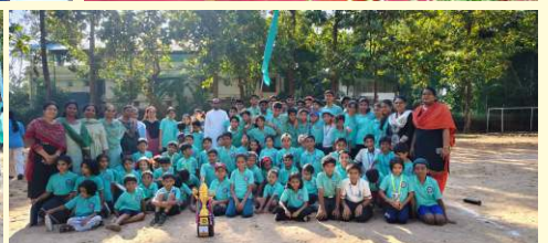
Runners Up - Faber House....