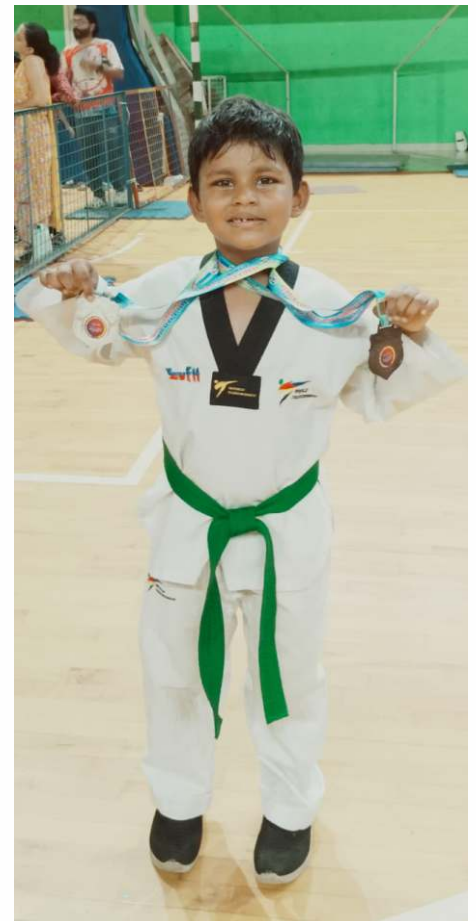
AADHIDEV CA Silver Medal Kyorugi category kiddles under 30 kg Bronze medal in poomsae held at kottayam